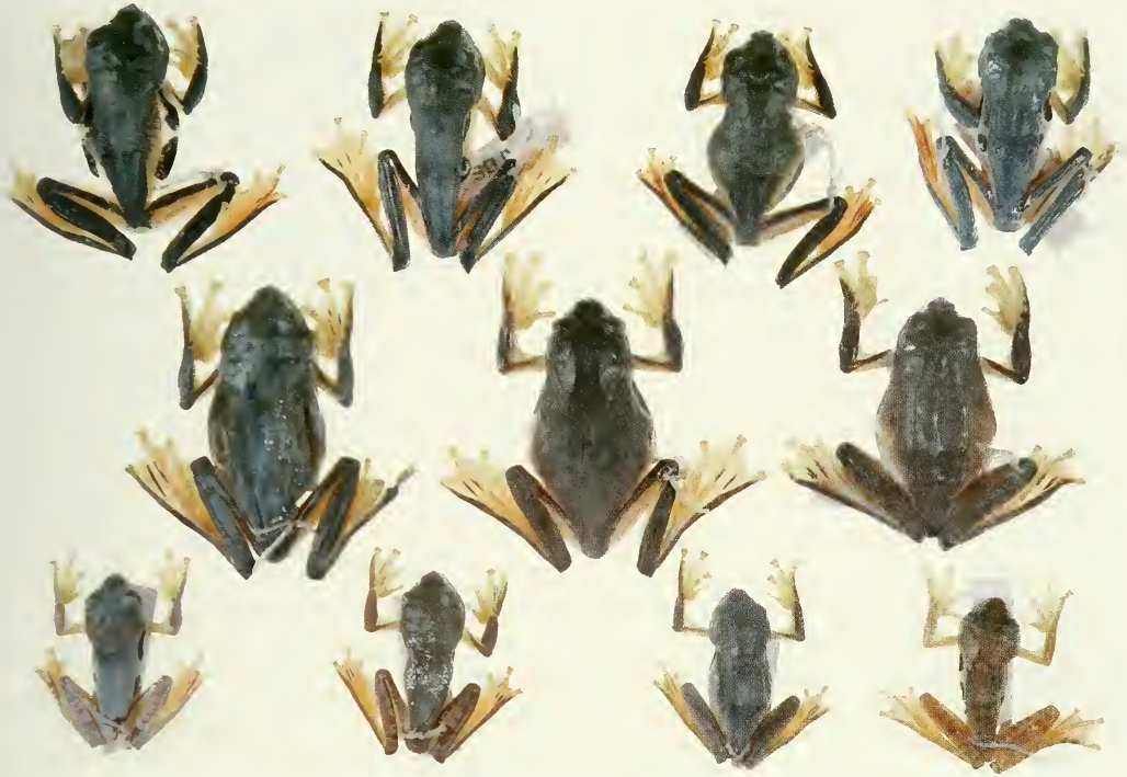
FIGURE 3. Dorsal view of representative specimens of Rhacophorus htunwini sp. nov. (top row), representative specimens of female R. bipunctatus (middle row), and representative specimens of male R. bipunctatus (bottom row).

the R. ualabaricus species group ( R. calcadensis and R. ualabaricus ), R. lateralis , R. pseudomalabaricus , and R. turpes by axillary spots.